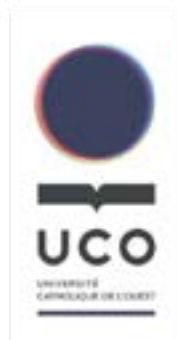
Université Catholique de l'Ouest France