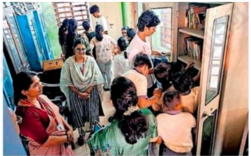
എറണാകുളം സെന്റ് ആൽബർട്ട്സ് കോളേജ് ഇംഗ്ലീഷ് വിഭാഗം തൃപ്പൂണിത്തുറ ആർ.എൽ.വി ഗവൺമെന്റ് സ്കൂളിൽ കുട്ടികൾക്കായി ഒരുക്കിയ ലൈബ്രറി.