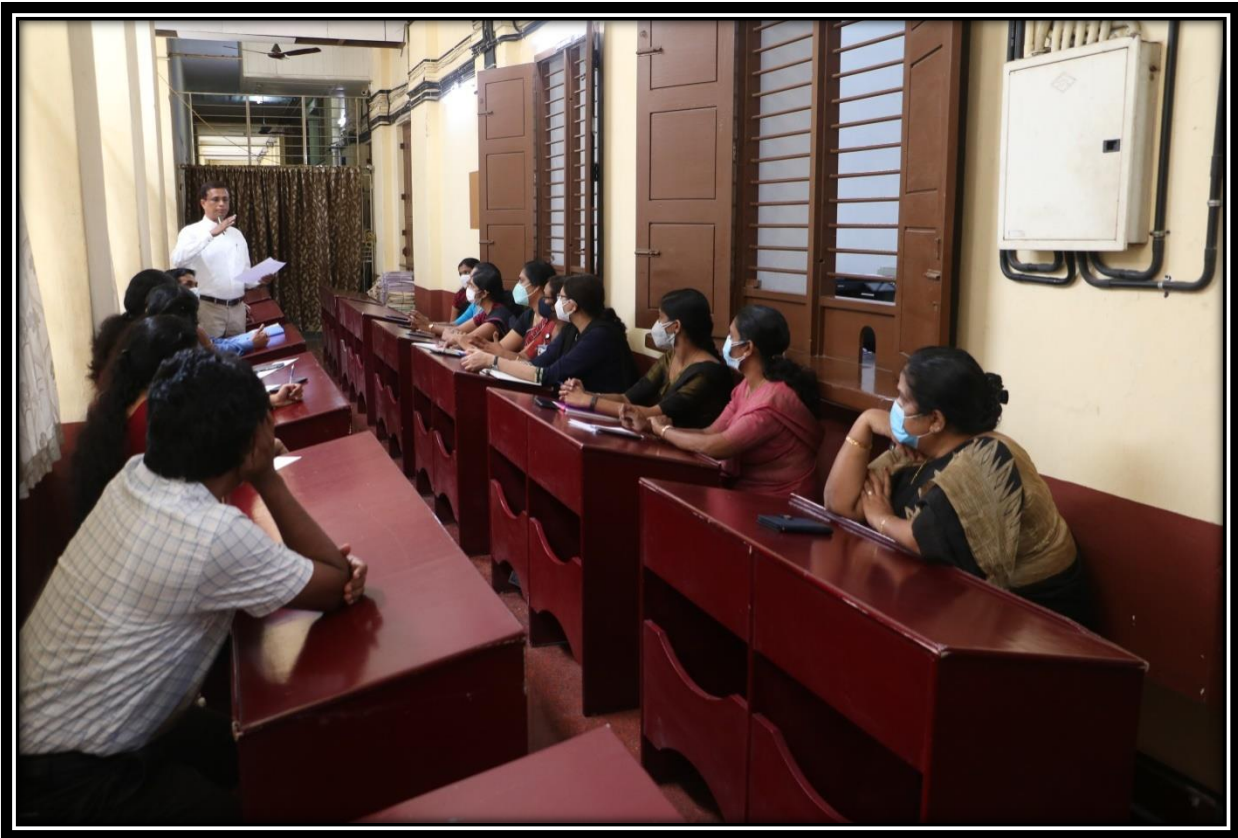
PASSBOARD - 05/11/2021- UGS2 2020 Admission