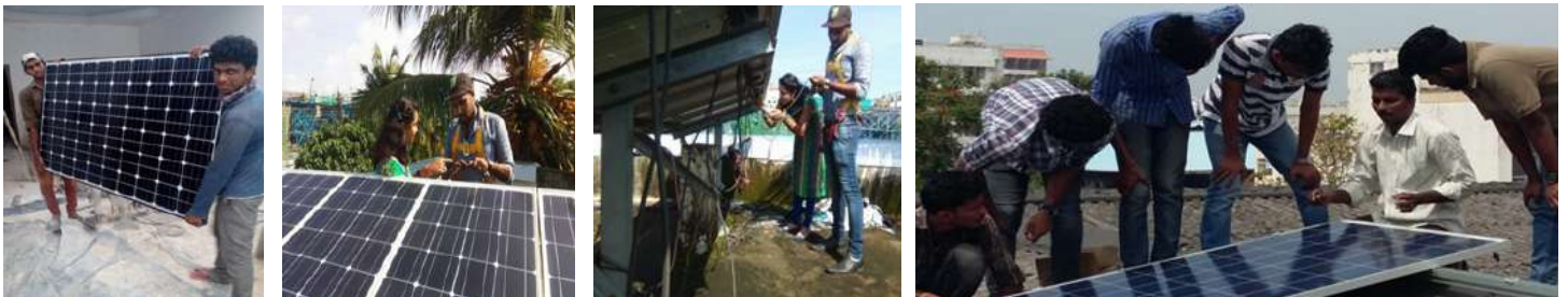
Students and teacher trainers with their assembled Solar Lamps

Students have to undergo 21 days of internship during the second semester and fourth semester at different industries.