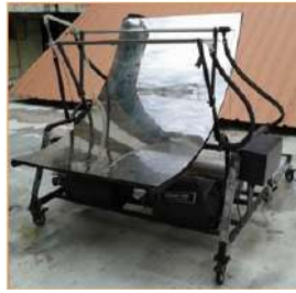
SOLAR THERMAL SYSTEM USING PARABOLIC TROUGH REFLECTOR