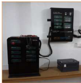
GRID-TIED PV TRAINING SYSTEM