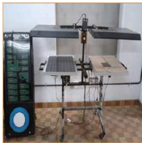
SOLAR PV TRAINING SYSTEM