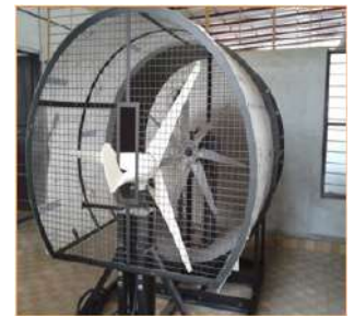
WIND ENERGY TRAINING SYSTEM