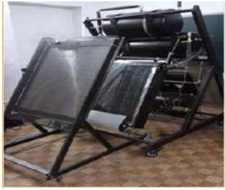
SOLAR THERMAL SYSTEM USING FLAT PLATE COLLECTOR