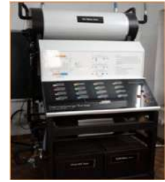
SOLAR THERMAL ENERGY STORAGE SYSTEM